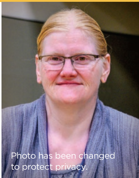
Photo has been changed to protect privacy.

"I am 100% convinced that if I had not come here, I would not be alive right now."